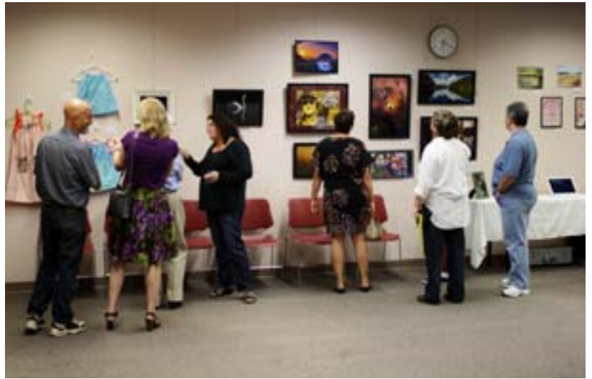
Faculty and family viewing and discussing the displayed work