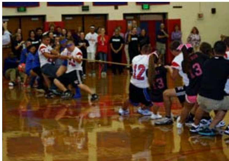
Top Left: Juniors and Sophmores seated in the Gymnasium Top Right: Seniors parading their school spirit Bottom: Tug of War - Juniors Vs. Sophmores

This year's pep rally was probably the most authentic one yet throughtout the years of Berlin High. The entire student body and faculty displayed their school spirit by showing off their pride, embracing their colors, and MOST importantly: the excitement and effort everyone put out there that surprised most of us that day.